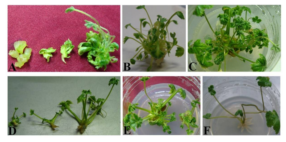
Fig. 2A. Callus development and organogenesis from petioles of H. scabridum on MS with 0.5 mg/l IAA and 3.0 mg/l Zn. B and C, shoot multiplication of H. scabridum , D and E represent direct organogenesis by stem tips explants and F. rooting.

Petiole explants also showed a good response for callus formation. After 7 days, on both ends of the explants were covered with loose and pea-green callus. Thereafter, shoots arose from the callus after 2 weeks (Fig. 2A). Differences in the rate of callus formation and organogenesis were observed in petiole explants. Highest rate was obtained with 0.5 mg/l IAA and 3.0 mg/l Zn, which yielded 17.83 \pm 4.87 shoots per explant.